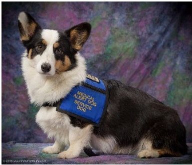
Kirby (age 6) - Pembroke Welsh Corgi