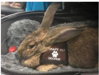
George (10 months old) - Flemish Giant Rabbit