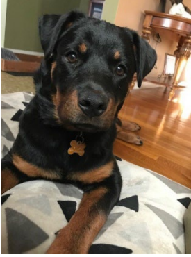
Roxanne von Otten (age 7 months old) – Rottweiler