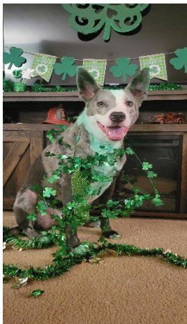
Aspen (age 3; Australian Shepherd mix)