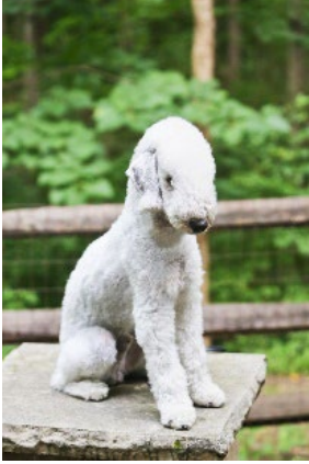
Chipper (age 4 ½) - Bedlington Terrier