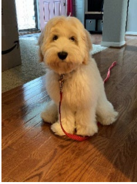
Baxter (age 5 months) – Australian Labradoodle