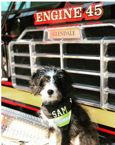
Sam (age 6 months old)- Berne doodle