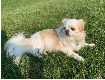
Fiona (age 10) - Japanese chin mix