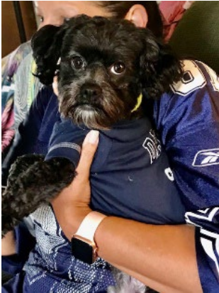
Mazzi (age 5 years) – Havapoo