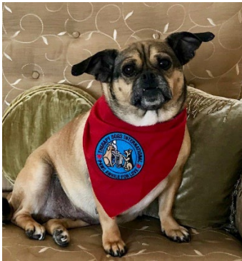
Crinkle (age 9 years old) - Pug Mix