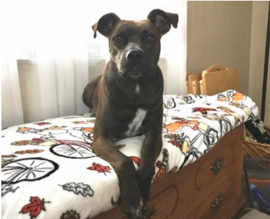
Carver (age 2) - Chocolate Lab, Boston Terrier and Boxer