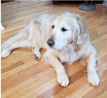
Roxie (age 11) – Golden Retriever