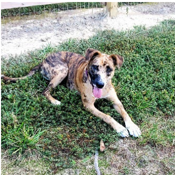
Praline (11 months) – mixed breed