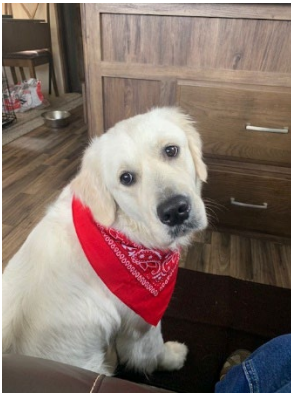
Bailey (2-years old) – cream Golden Retriever