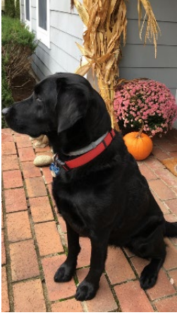
Sweetpea (age 7) – Labrador Retriever