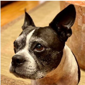
Minnie (age 9) – Boston Terrier