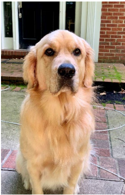
Popcorn (age 2) – Golden Retriever