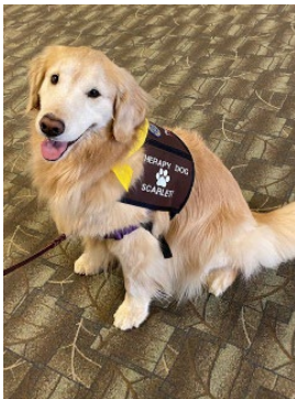
Scarlett (age 7) - Golden Retriever